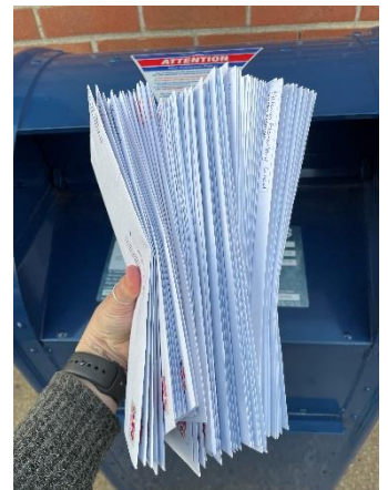
Figure 2 First round of letters ready for mailing