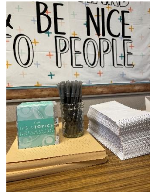
Figure 1 Supplies for project

Funds from this project allowed us to purchase stationery and pens for composing our letters. We were also able to purchase Table Topic Conversation starters to facilitate discussions and brainstorm communication ideas for our letters. Funding also allowed us to purchase envelopes and stamps for our two letters per student as well as for stamps and envelopes for our partner school.