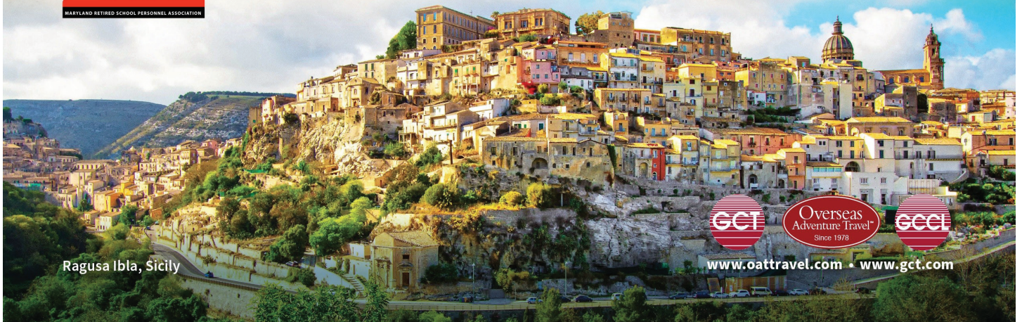
Ragusa Ibla, Sicily

Just make sure to mention MRSPA booking code: 28192