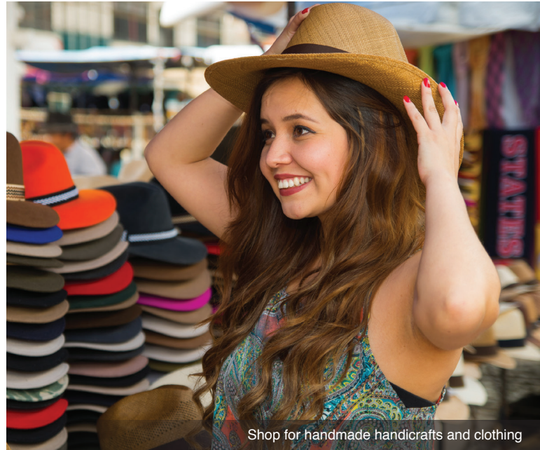
Shop for handmade handicrafts and clothing

DAY 1 USA / Panama City, Panama: Depart the USA on your flight to Panama City. Upon arrival, you'll be met by a Mayflower Cruises & Tours representative and transferred to your hotel. Flights should arrive by 4:00pm. The afternoon is at leisure to become acquainted with your new surroundings. This evening, join your Tour Manager for an orientation meeting at the hotel.