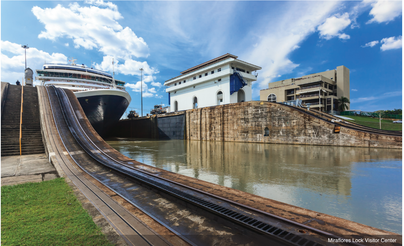
Miraflores Lock Visitor Center